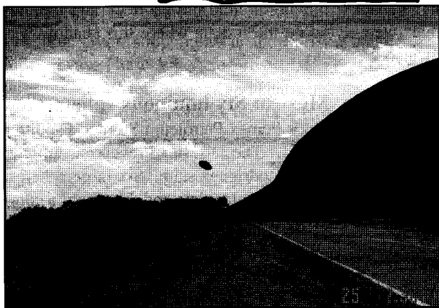
Northern Territories flying disc. Taken 100 km north of Alice Springs.

What is far less clear is to what extent overt close contact and daylight UFO activity have penetrated our indigenous cultures in the last fifty years? We need to strategically assess how close this phenomenon has come. What can we gauge about populations and specific parts of our planet that these entities seem to give priority. Finally, we come to Australian Aboriginal reports which originate from oral history and anecdotes collected by other researchers in the Northern Territories. This is merely a taste of what might be going on in remote areas of Australia. The next chapter of my indigenous survey will be from among the Australian Aborigines.