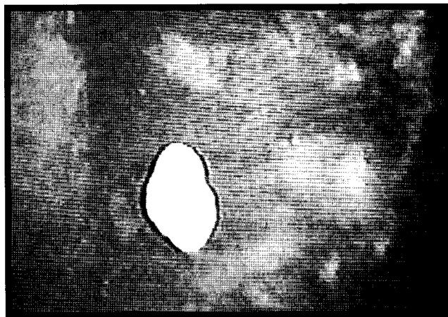
A glowing object traverses below the cloud base

Introduction by FSR: It is a common fallacy, put about by debunkers, that ufos are only seen by people who are inexperienced observers and/or who are unreliable witnesses. There are thousands of reports from high calibre witnesses such as civilian and military pilots - and other military - personnel. That is why certain bodies (official and/or top secret) in the US, Britain, France, the Soviet Union and other countries and regions have taken a great interest in the